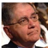
Prof. Rocco Buttiglione Presidente del Consiglio Nazionale UDC Palazzo Montecitorio Rome, Italy