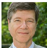
Prof. Jeffrey D. Sachs Director of The Earth Institute, Quetelet Professor of Sustainable Development, and Professor of Health Policy and Management at Columbia University, New York, USA