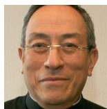
H.Em. Card. Oscar A. Rodríguez Maradiaga Archbishop of Tegucigalpa (Honduras), Coordinator of Pope Francis' Council of Cardinals