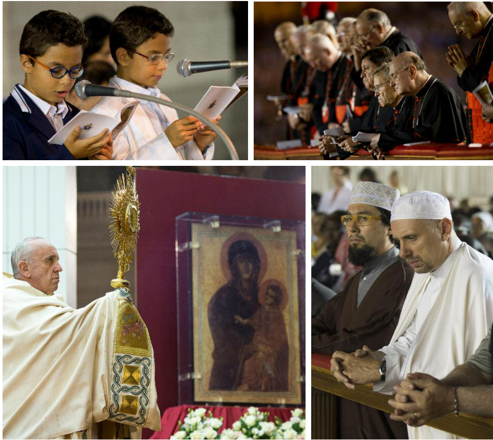
Digiuno per la Siria, 7 settembre 2013 • Fast for Syria, 7 September 2013